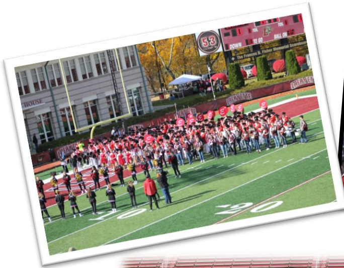
Lafayette Football Game – November 3, 2018