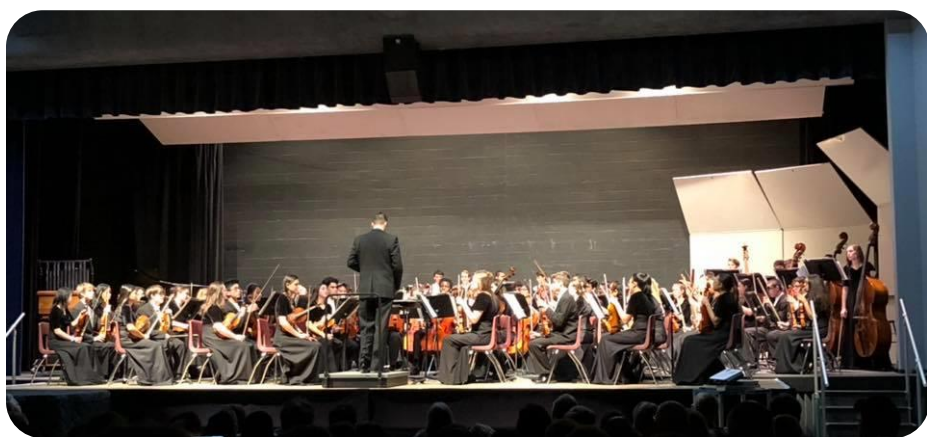
Fall Orchestra Concert November 14, 2018