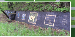
"Young Master's Wall" artwork by local students