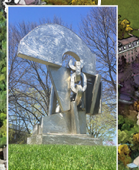
Transcendence Mel Edwards

Trail Distance – 2 miles A – B .....0.8 miles B – C .....0.3 miles C – D .....0.3 miles D – E .....0.3 miles E – F .....0.3 miles