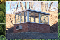
The Garden House "Windows into the Mine" Julie Buntaine