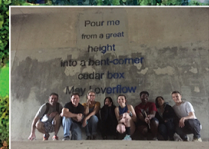
"Funeral", by Beth Seetch, Cemetery tunnel