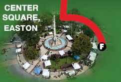
CENTER SQUARE, EASTON

Trail Distance – 2 miles A – B .....0.8 miles B – C .....0.3 miles C – D .....0.3 miles D – E .....0.3 miles E – F .....0.3 miles