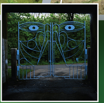
"Grace Gate" by Willie Cole