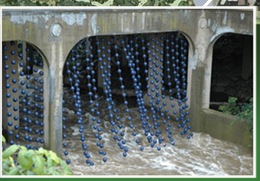
Bushkill Curtain Stacy Levy