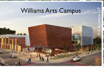
Williams Arts Campus