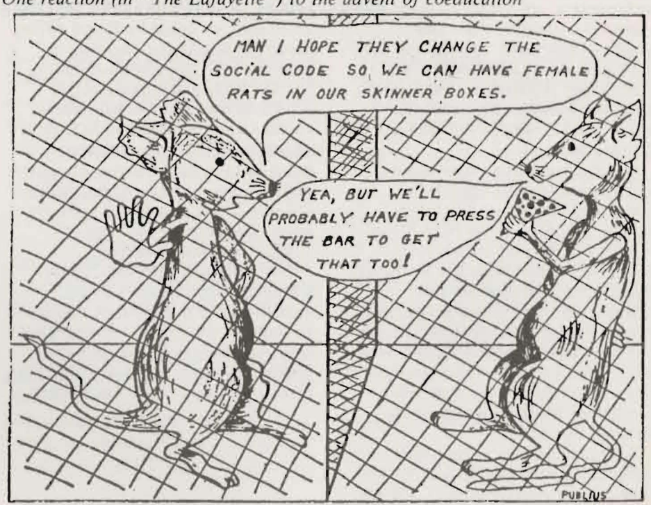
One reaction (in "The Lafayette") to the advent of coeducation

In a visit the following day, the dean of students informed me that this particular hue was, in the opinion of the College authorities, totally inappropriate for the College's first houseful of women. It was clear that this objection was based on some vague moral alarm, but the precise nature of the complaint was never