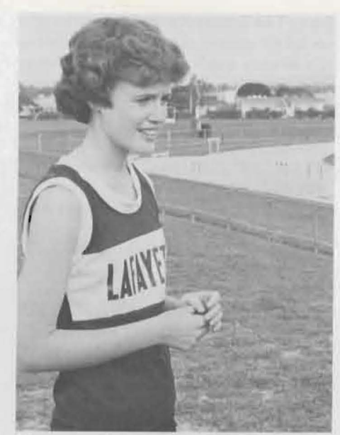
Pierce: varsity-status seeker

Another woman athlete with quite a different set of concerns is Lenora