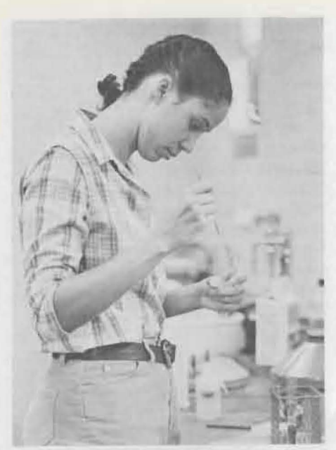
Johnson: A.B.C. devotee

Johnson as a black woman finds little social life at Lafayette. She attends an occasional cocktail party, a pub night rarely, and finds there are few other social options. While she and other black students find surface acceptance, there too, they are dealing with inbred attitudes that will not quickly dissipate.