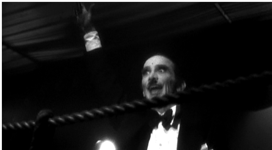
Figure 3. Fascism is dirty: the Emcee parodies fascist aesthetics and politics by using mud from the debased wrestling match to create a Hitler mustache.

laugh not only at the rhythmic slapping, but also at the beating delivered by the Brownshirts. The “Slaphappy” number is an example of stylized violence crosscut with actual violence, so the critique concerns the ways in which style can mask violence. The Emcee’s various appropriations of fascist pageantry are introduced to suggest how fascist aesthetics encourage people to view violence as a ritual. The Emcee’s numbers reproduce this ritual to mock it through ironic distance. Such distance is evident when, as the “Slaphappy” number concludes, the Emcee stands in mock triumph over one of the fallen women and flaps his arms as he crows a victory. This happens as the Brownshirts leave the club owner bleeding in the alley and the audience roars in delight. For the Kit Kat Klub audience, the Emcee’s action could be read as a playful endorsement of Nazi brutality, but, once again, for the film audience, the act ought to be read as parody. 30 Fascist politics are dirty, and the stylized “sport” of mud wrestling and the ritualized slapping, however playful-seeming, are examples of how the film draws attention to the simultaneous appeal and danger of fascist aesthetics. Whereas fascist aesthetics foreground style over substance, in the Kit Kat Klub the Emcee’s style becomes the substance, and this transformation has a point: to demonstrate the uses to which such style might be put, an awareness that the comforting unity of fascist aesthetics seeks to cover.