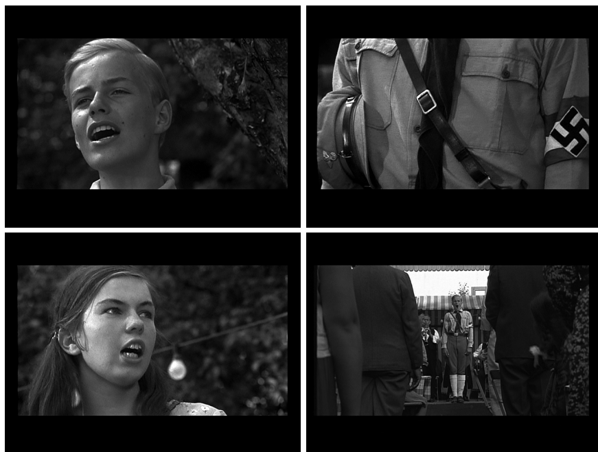
Figure 1. Fascist aesthetics in action: the camera pans slowly down to reveal that the singer of a beautiful song is a Hitler Youth; as his song grows more forceful, onlookers join in until finally the crowd is singing as one voice. The consolidation of voices is registered visually in the bottom right frame, in which all the singers stand as one.

influential interpretations—most notably by Ernesto Laclau and Chantal Mouffe, who are again reread by Slavoj Žižek—recent accounts of fascist aesthetics emphasize how, as a master signifier, fascism “quilts” together what may otherwise be beyond its purview. Writing on fascism and music, for example, Peter Tregear discusses the conceptual power of “what Lacan famously called le point de capiton ; fascism, if you like, ‘sews up’ or ‘quilts’ the heterogeneous material of everyday political life into a unified ideological field, and by this means the political realm is able to be presented as a space in which the otherwise absurd notion of a ‘sublime’ union between the individual and the community is made possible.” 14 The beer-garden scene in Cabaret illustrates how fascist aesthetics seek to “quilt” “heterogeneous material” (the varied faces of everyday Germans) into a “unified ideological field” (the fascist notion that, if the constituent parts of a collective become one, tomorrow will belong to the one). In the beer garden, the aesthetic space becomes a political space not only in the moment when the camera pans down to the Nazi armband, but in the moment