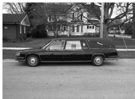
Dr. Cadaver arrives to teach Calculus

"As a math teacher, I understand how important it is for students to see that mathematics can connect with life. Mor-